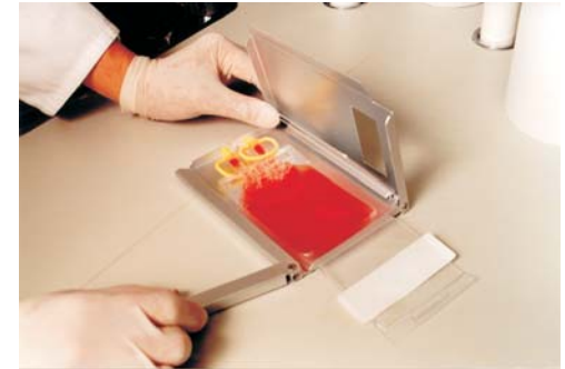
Processed cord blood unit in cassette

Donors make this first gift on behalf of their newborn baby.